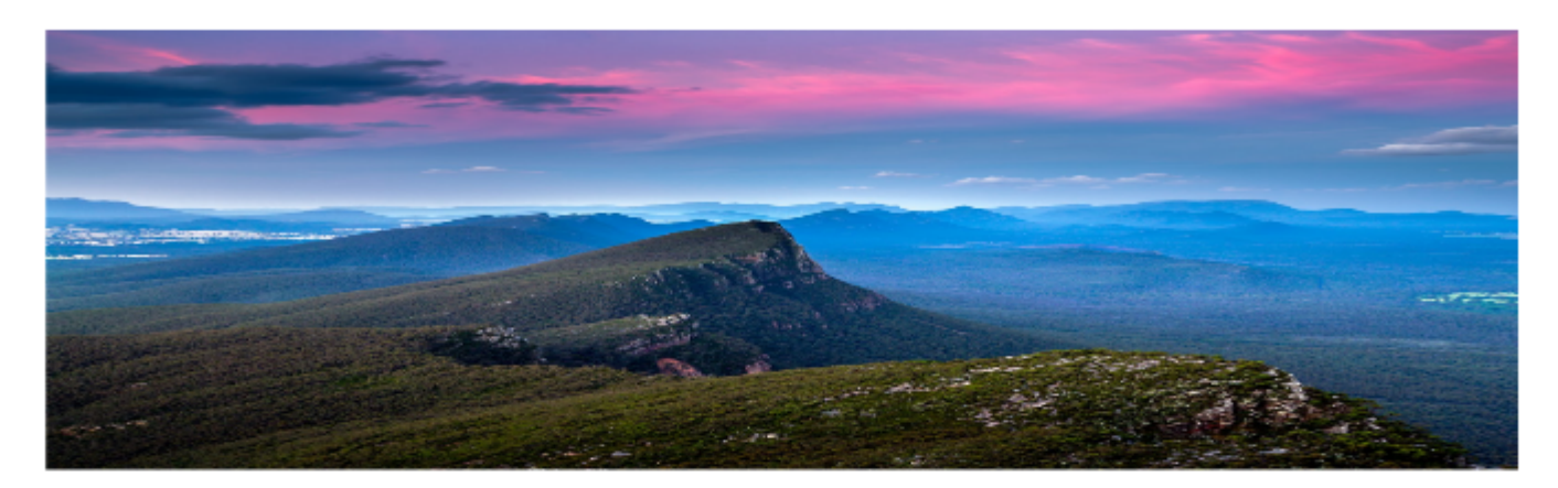
8 Days / 7 Nights